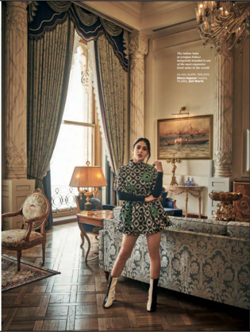
The Sultan Suite at Cragan Palace Kempinski Istanbul is one of the most expensive hotel suites in the world.

I have developed an inherent respect for native people—whether it's in my country or outside, and it's important that we travel without depleting their environment. Being conscious about things like using public transport, disposal of garbage, etc. are important. Like when I am in Istanbul, I use trams.