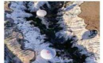
Looking down at the rock formations of Love Valley.