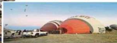
Watching how the hot air balloons are being set up.

The landing is done in a very professional manner — it's so smooth that it feels really safe and nobody was scared. Apparently, it is assisted by the ground crew, who pull down the balloon once it reaches near ground level and safely place the basket onto a trailer with the balloon still attached. The trailer is then moved to another location for the passengers to get off and join a celebration party organised by Atmosfer Balloons.