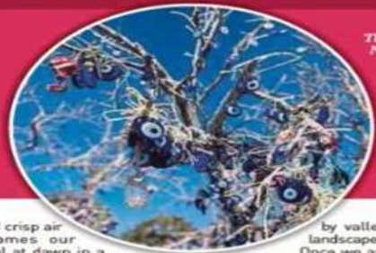
The Blue Eye or Nazar Boncuk (Evil Eye) is a good luck charm, and Turkish people believe that this amulet protects them from misfortune.

F RESH crisp air welcomes our arrival at dawn in a location somewhere between Avanos and Urgup, the two most-visited districts of Nevsehir province.